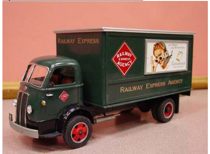
Theme Winner: Carl Rees - Railway Express Truck