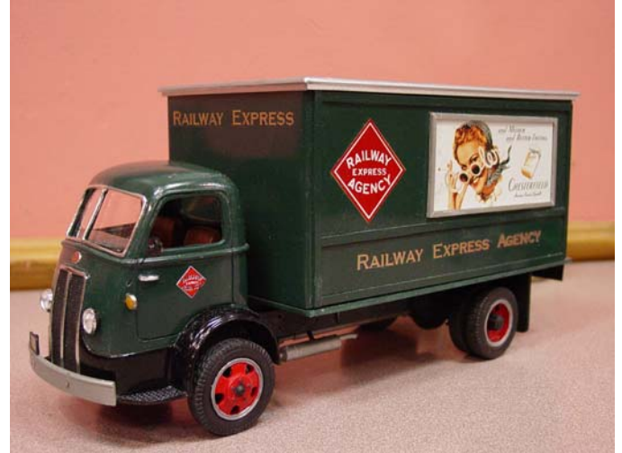
Theme Winner: Carl Rees - Railway Express Truck