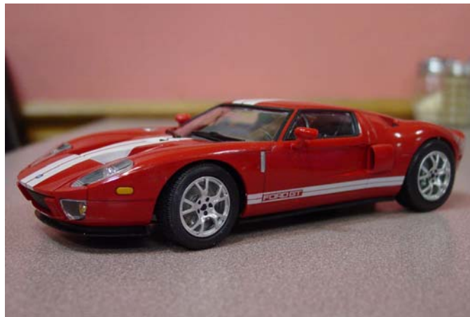
Theme Winner: Carl Rees - Ford GT